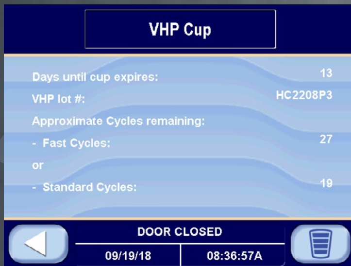
VAPROX HC Sterilant Smart Cup information on the V-PRO maX 2 and s2 Low Temperature Sterilizers